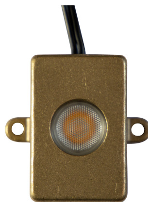
400 Lumen Mini Beam