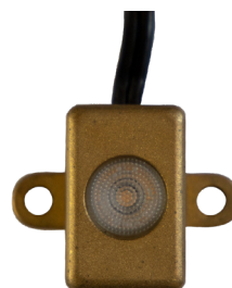
90, 200 Lumen Mini Beam